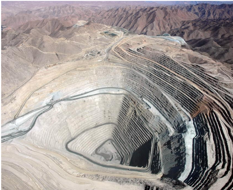
Toquepala Southern Copper Corp.